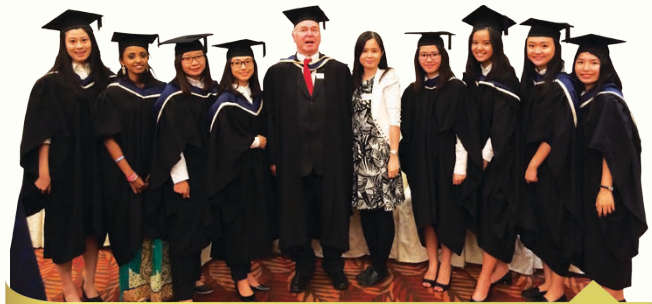
Oxford Brookes University Graduation Ceremony 2016 (Malaysia)