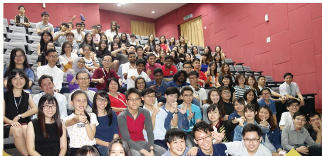
Cambridge A-Levels Class of January & March 2016