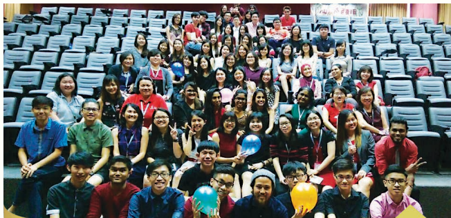
Australian Matriculation Class of January & March 2016