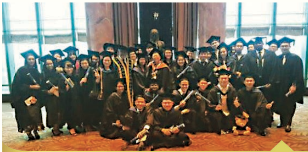
Victoria University Graduation Ceremony 2017 (Malaysia)