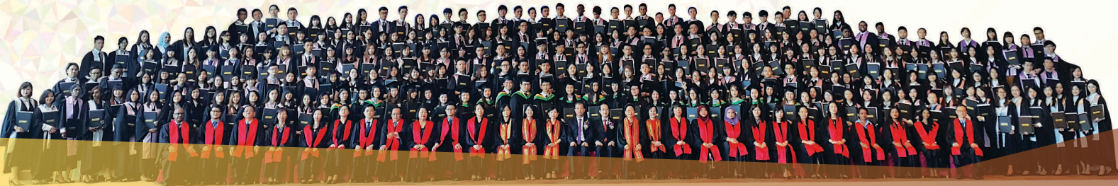
ACCA & Diploma Programmes Graduation Ceremony 2016