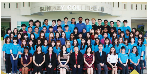
Certified Accounting Technician Class of 2016