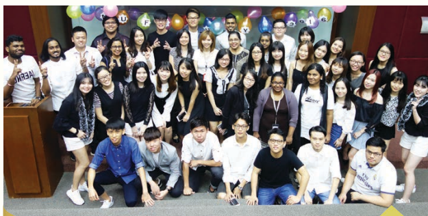
Monash University Foundation Year Class of July 2016