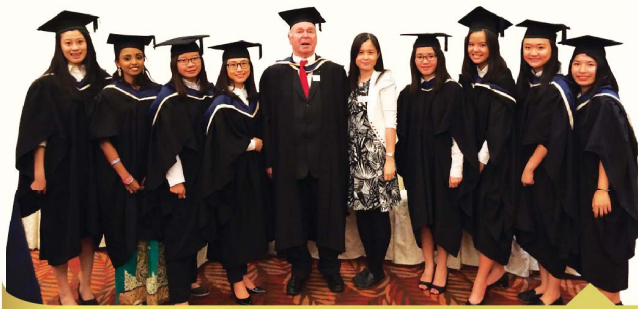
Oxford Brookes University Graduation Ceremony 2016 (Malaysia)