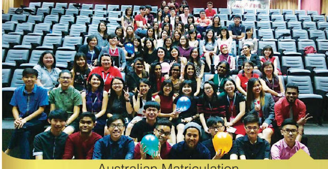
Australian Matriculation Class of January & March 2016