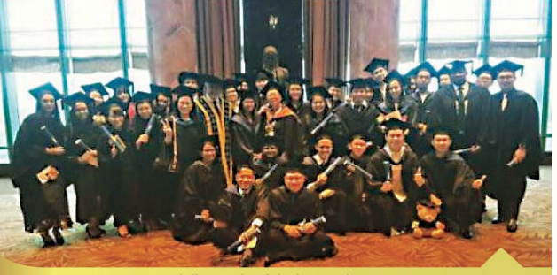
Victoria University Graduation Ceremony 2017 (Malaysia)

ACCA & Diploma Programmes Graduation Ceremony 2016