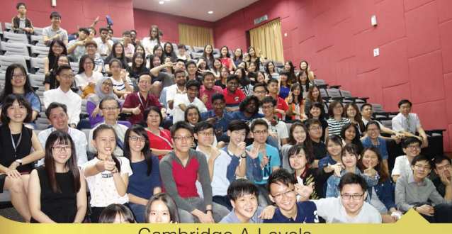
Cambridge A-Levels Class of January & March 2016