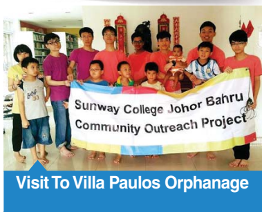
Visit To Villa Paulos Orphanage