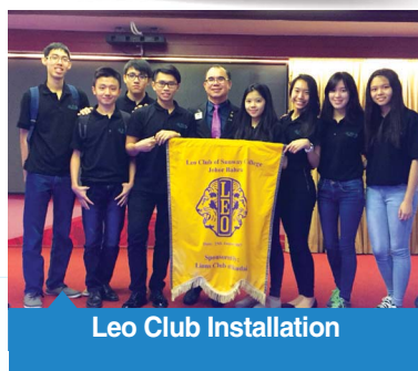
Leo Club Installation