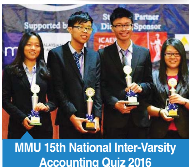
MMU 15th National Inter-Varsity Accounting Quiz 2016