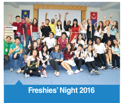
Freshies' Night 2016