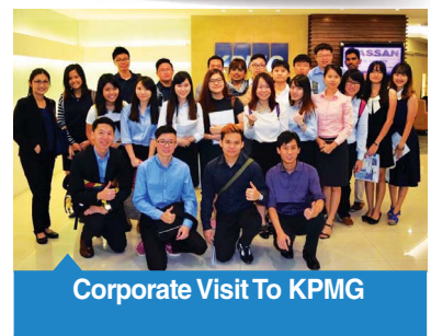
Corporate Visit To KPMG