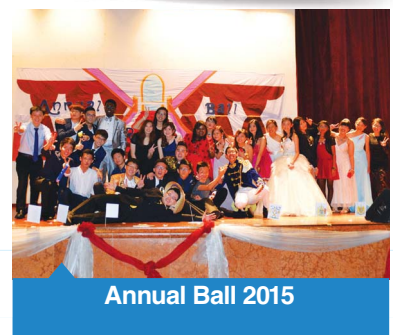
Annual Ball 2015