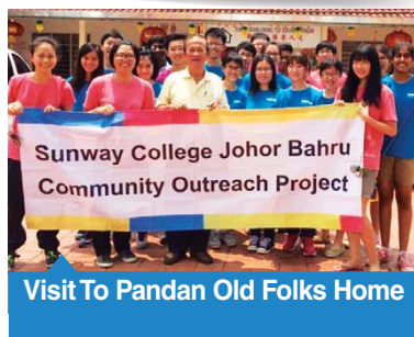
Visit To Pandan Old Folks Home