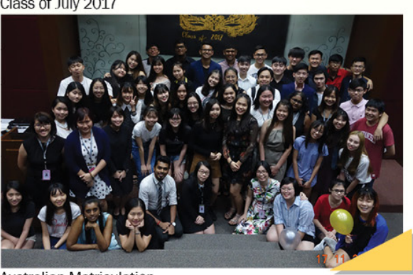
Australian Matriculation Class of January and March 2017